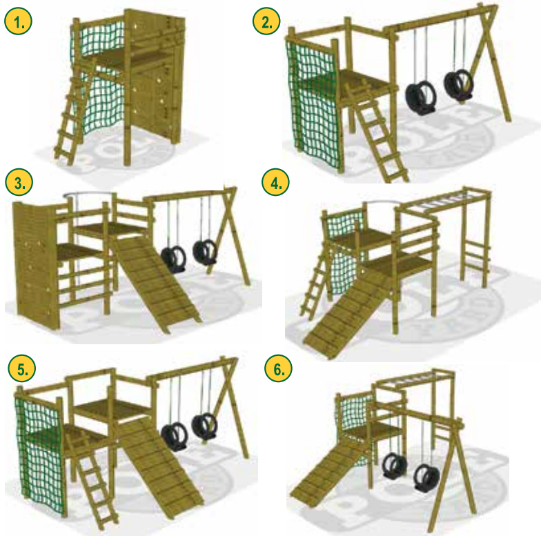
1. Dassie 2. Baboon 3. Buffalo 4. Cheetah 5. Cobra 6. Eagle