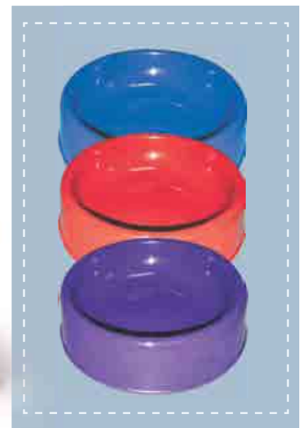
Karoo dry dogfood (Adult), Daro plastic dog bowl