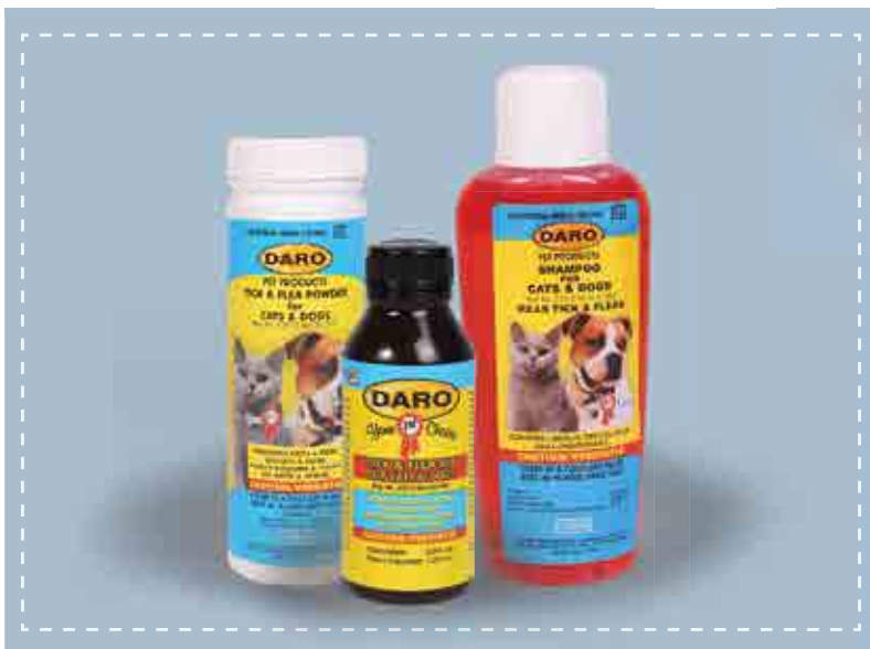
Daro dog tick & flea powder, Daro dog tick & flea dip, Daro dog tick & flea shampoo

Pets and people aren't the only ones excited about the warmer weather. Fleas and ticks love summer too. And they have a head start thanks to climate change and milder winters that allow them to remain active for longer periods. You can expect large numbers of fleas and ticks to embark on your furry friends in spring. If you've let external parasite control slip a little over winter, this is the time to pick it up again.